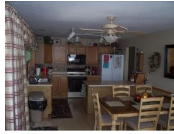
14A112 Deer Run Lane Apple River, IL 61001 $399,000.00