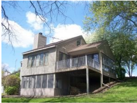
1a15 silverhorn Apple River, IL 61001 $249,000.00

3505 N.E. Apple Canyon Road Apple River, IL 61001 Phone (815) 492-2231 Fax (815) 492-1484